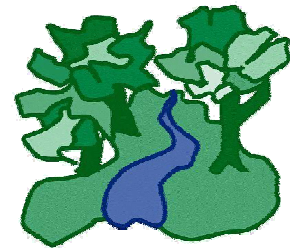
Wilson Inlet Catchment Committee Inc.