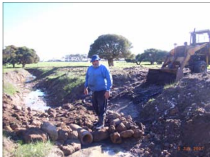
Construction begins on riffle crossing. Bank reshaping and planting will stabilise the banks.