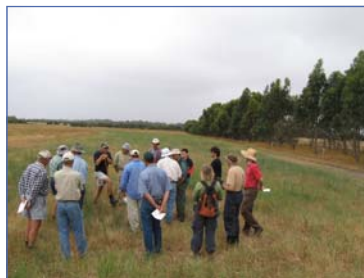
Wilson Inlet and Torbay farmers getting advice on suitable perennial pastures for wet paddocks.

An alternative to a double knock is to spray top the paddock the year before to remove as much rye grass annual grass weeds as possible. This has the added bonus of increasing