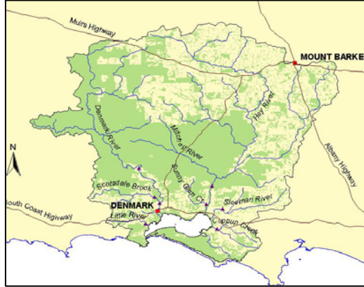
The Wilson Inlet catchment covers 2254sq.km of farmland, forests and towns.

Major activities under the WINRAP include helping landowners to improve fertilizer efficiency through improved pasture